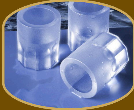
Ice Shot Glasses