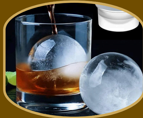
Crystal Round Ball