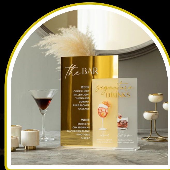
Mirror / Wood Menu