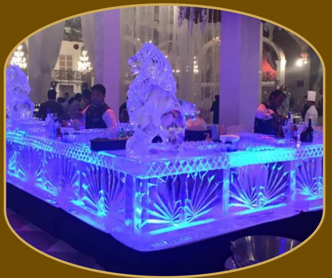
The Ice Bar