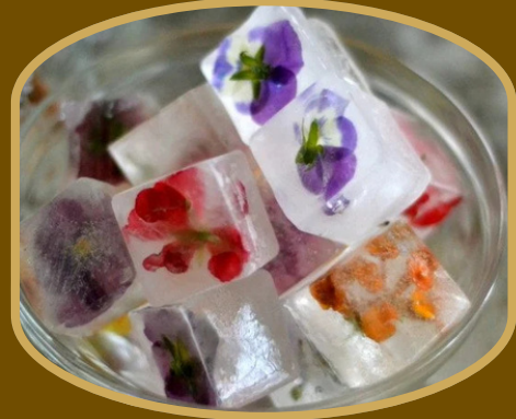
Ornamental Infused Ice