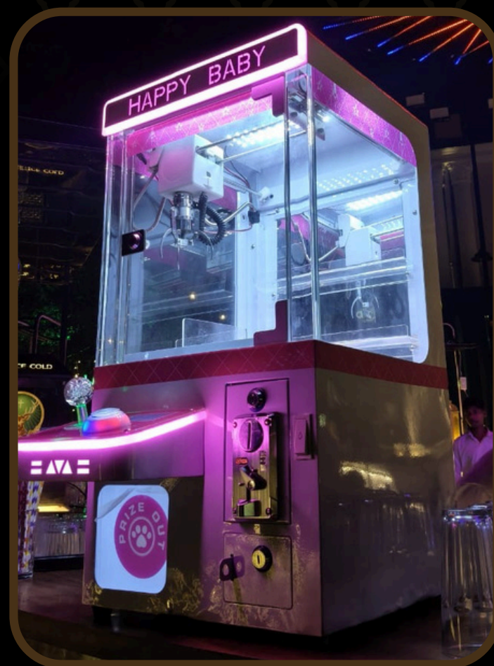
CLAW CRANE GAME

To serve two types of refueling SHOOTERS